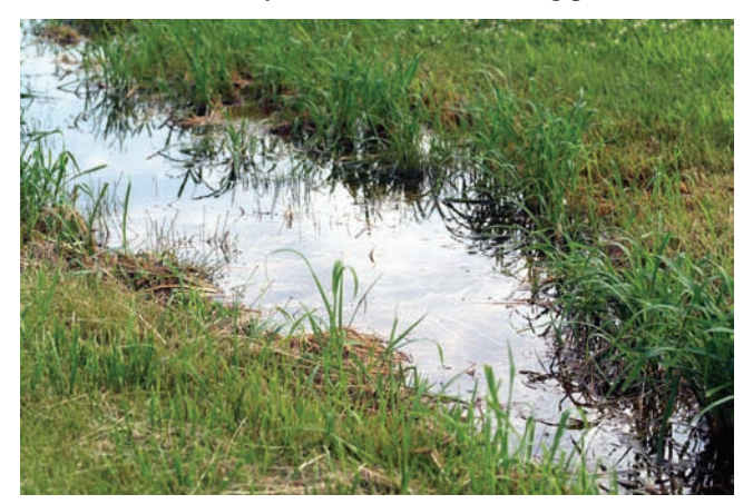
Figure 4. Potential mosquito breeding site.

Eliminate Breeding Sites. Mosquito breeding sites in urban and residential areas include children's wading pools, rain barrels, birdbaths, flower pot bases, clogged gutters, pails, and discarded tin cans — anything that can trap and hold water. Additional sites for acreages and country settings (Figure 4) include ponds, ditches, sewage lagoons, and used tires. Because mosquitoes breed quickly in the summertime, standing water should be drained weekly. Rinse and clean birdbaths on a weekly basis and cover wading pools.