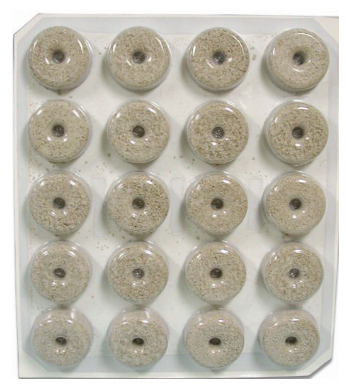
Figure 5. Mosquito briquets slowly release Bti or methoprene for larval mosquito control and are effective for 30 days.

A formulation of Bacillus sphaericus (Vectolex CG^{TM} ) can be used in water with high levels of organic matter such as stagnant sewage lagoons.