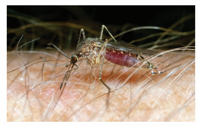
Figure 1. Adult mosquito following blood meal.

Mosquito larvae, also called "wrigglers" (Figure 3), survive best in still water, where they can come to the surface and