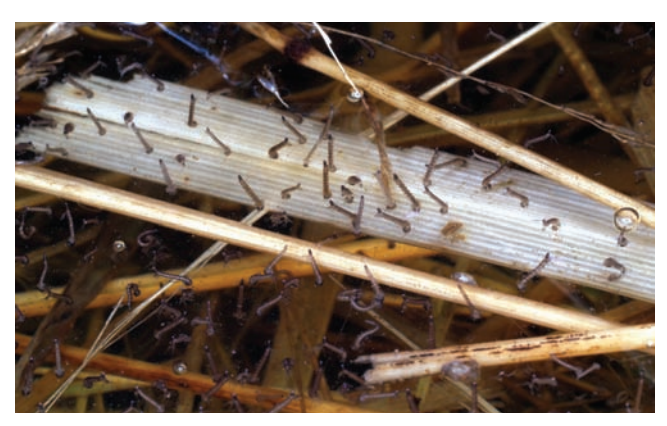
Figure 3. Mosquito wrigglers.