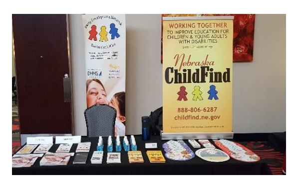
April 8, 2017 Kearney, NE