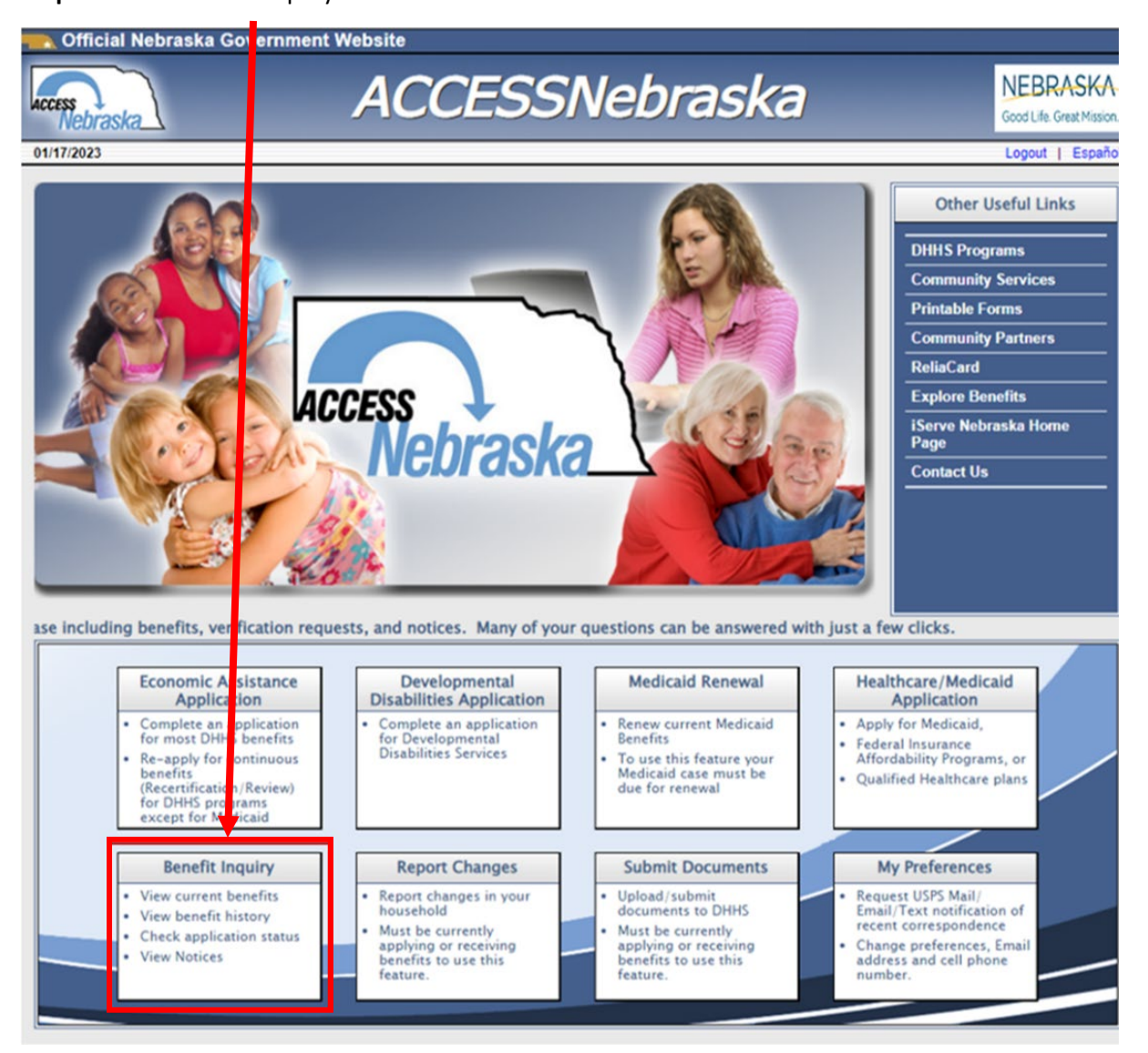
Step 2: Select Benefit Inquiry

Toll Free: (855) 632-7633 Omaha: (402) 595-1178 Lincoln: (402) 473-7000 TDD: (402) 471-7256