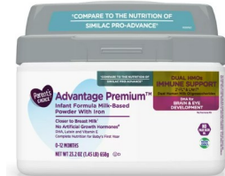
Parent's Choice Advantage Premium 23.2 oz