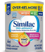
Similac Pro Advance 30.8 oz