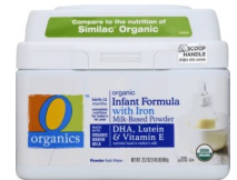
O Organics 23.3 oz