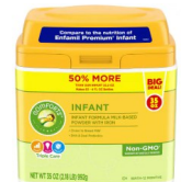
Comforts Infant 35 oz