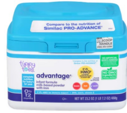
Tippy Toes Advantage 23.3 oz