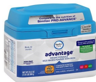
Signature Care Advantage 23.2 oz