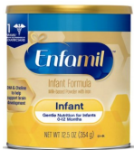
Enfamil Infant Powder 12.5 oz, 21.1 oz and 29.4 oz