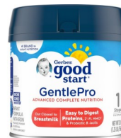
Gerber Good Start Gentle Pro 20 oz and 32 oz