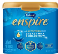
Enfamil Enspire 20.5 oz and 27.4 oz