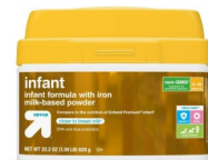
Up & Up Infant 22.2 oz, 35 oz