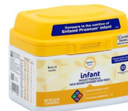
Signature Care Infant 22.2 oz