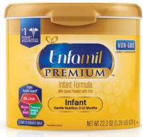
Enfamil Premium 22.2 oz