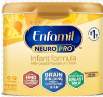
Enfamil NeuroPro Infant 20.7 oz, 28.3 oz