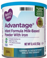
Parent's Choice Advantage 12.4oz, 23.2 oz, 36 oz