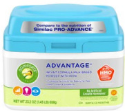
Comfort's Advantage Formula 23.3 oz and 35 oz

Your WIC benefits will say Similac Advance 12.4 ounces, but you can purchase: