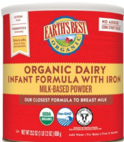
Earth's Best Organic Dairy 21 oz or 32 oz