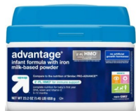
Up & Up Advantage 23.2 oz