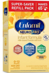
Enfamil NeuroPro Infant Refill box 31.4 oz and 36.4 oz