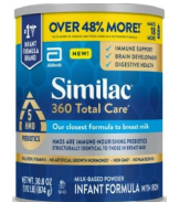
Similac 360 Total Care 20.6 oz and 30.8 oz