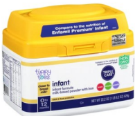
Tippy Toes 22.2 oz