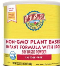
Earth's Best Soy 23.2 oz