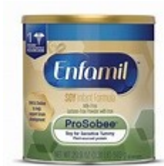
Enfamil ProSobee 12.9 oz and 20.9 oz

Your WIC benefits will say Similac Soy Isomil 12.9 ounces, but you can purchase: