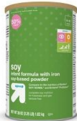
Up & Up Soy 36 oz