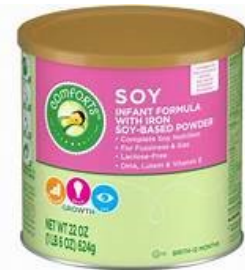
Comforts Soy 22 oz