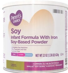
Parent's Choice Soy 22 oz