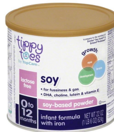
Tippy Toes Soy 22 oz