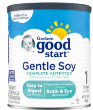
Gerber Good Start Soy 12.9 oz and 20 oz