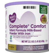
Parent's Choice Complete Comfort 22.5 oz