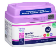
Tippy Toes Gentle 21.5 oz