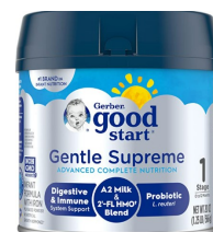
Gerber Good Start Gentle Supreme 20 oz