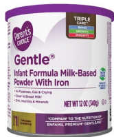
Parent's Choice Gentle 12 oz, 21.5 oz, 33.2 oz