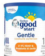
Gerber Good Start Gentle 12.7 oz