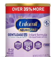
Enfamil Neuropro Gentlese 19.5 oz and 27.4 oz