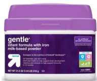
Up & Up Gentle 21.5 oz