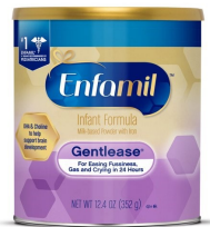
Enfamil Gentlese 12.4 oz, 19.9 oz and 27.7 oz

Your WIC benefits will say Enfamil Gentlese 12.4 oz , but you can purchase: