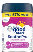
Gerber Good Start Soothe Pro 12.4 oz, 19.4 oz, 30.6 oz