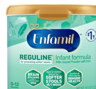
Enfamil Reguline 12.4 oz and 19.5 oz