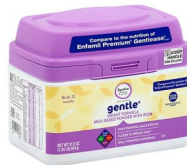
Signature Care Gentle 21.5 oz