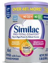
Similac Pro Total Comfort 29.8 oz