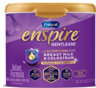
Enfamil Ensipire Gentlese 19.5 oz and 29 oz