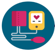
HIGH BLOOD PRESSURE

Anyone can have a stroke at any age, but certain factors can increase your chances of having a stroke, and it is important to understand your risk and how to lower it. 80% of strokes can be prevented. 5