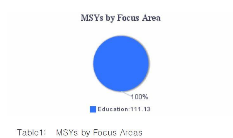
Table 1 and its corresponding pie chart show the total number of MSYs by Focus Area. Since both the K-12 Success and School Readiness objectives are in the Education Focus Area, Table 1 shows 100% of MSYs in Education.