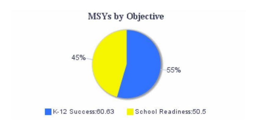
Table2: MSYs by Objectives

Table 2 and its corresponding pie chart show the same MSY information expressed as percentages of the total MSYs: