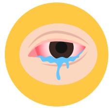
Red, watery eyes

OR been in contact with someone known or suspected to have measles in the past 21 days