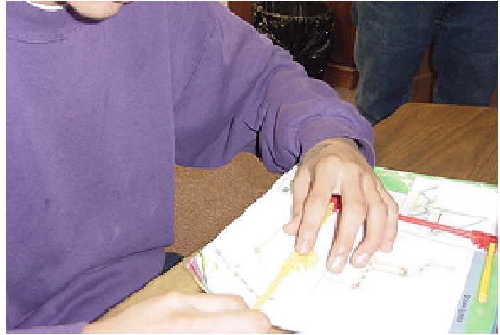
Youth learning hands on.

The school's staff, 22 teachers and school principal, all hold professional certificates from the Nebraska Department of Education. This school year the staff authored 392 Individualized Educational Plans (IEP) and Education Plans (EP).