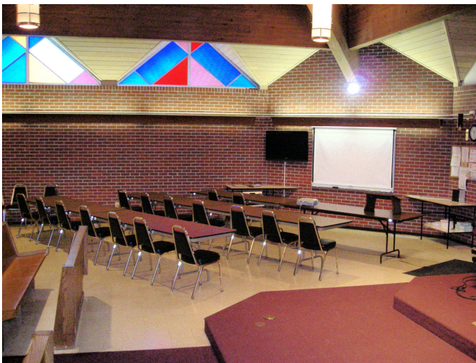
YRTC-K Training Area

The following is the budget allocated to the facility by DHHS for the FY 2009/10.