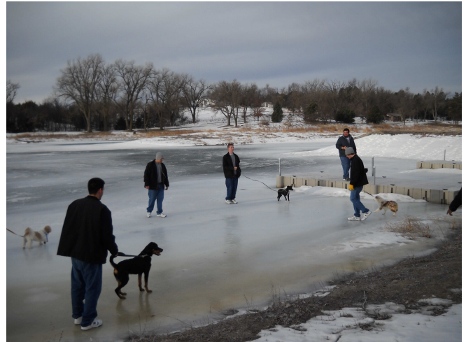
Youth exercising dogs for the Humane Society

A full-time Clinical Psychologist joined the YRTC-K team in September 2009. The Clinical Psychologist provides supervision of the treatment program, consultation regarding individual youth, assessments and follow up with individual referred youth and crisis intervention. In addition the Clinical Psychologist assists with administrative supervision of the Mental Health Department and programming staff, assists staff with Employee Assistance Program (EAP) referrals and reviews and updates procedures for supervised departments.