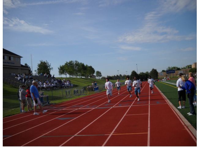
YRTC-K Annual Track Meet

YRTC-K has a wide variety of recreational equipment and areas that the youth have ready access to. This includes concrete play pads for each living unit. During the year, the youth participate in intramural sports. These seasons include softball, football, volleyball, basketball, soccer and beach volleyball. The youth can swim in the YRTC-K pool during recreation time and during Physical Education classes.