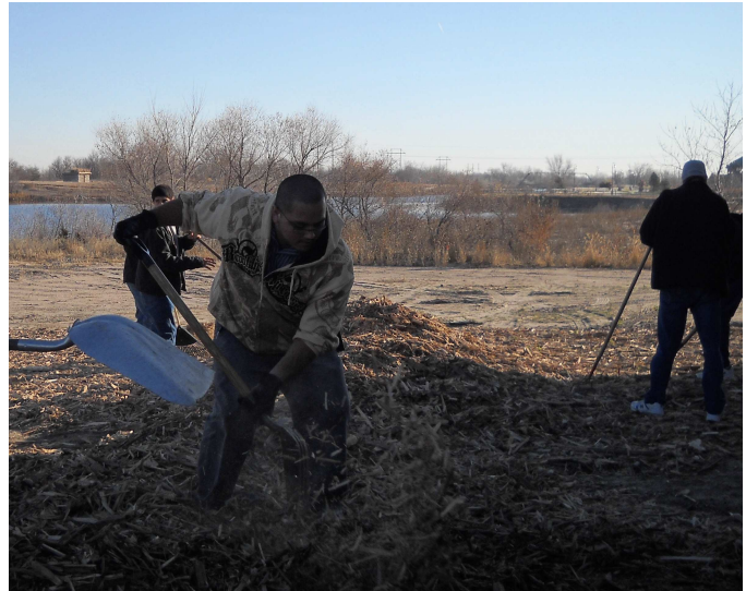
Staff (in front) and youth volunteering at the new Nebraska Firefighter Museum