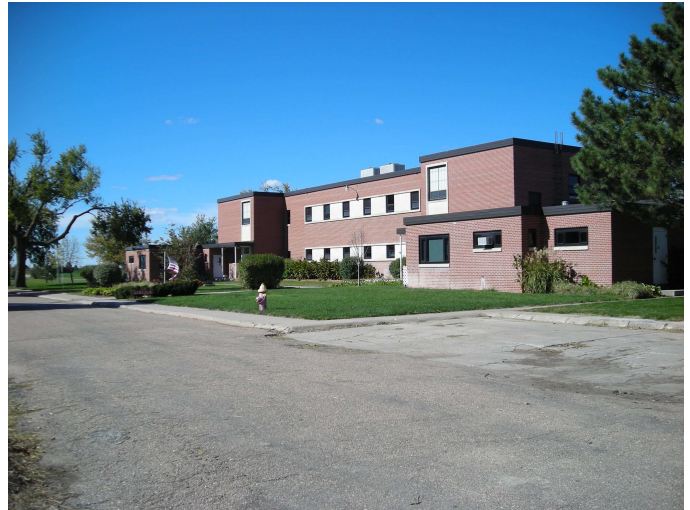
Lincoln/Washington Living Units

Youth Level of Service/Case Management Inventory (YLS/CMI) is completed on all YRTC-K youth as part of Classification procedure to assess their risks and needs. The orientation staff continue to work hard to ease each new YRTC-K youth into the treatment program and provide leadership and counseling for first-time commitments.