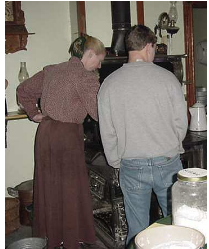
Youth at the Stuhr Museum in Grand Island.

One hundred nineteen (119) youth were paroled to the Hastings Juvenile Chemical Dependency Program (HJCD) for long-term Chemical Dependency treatment.