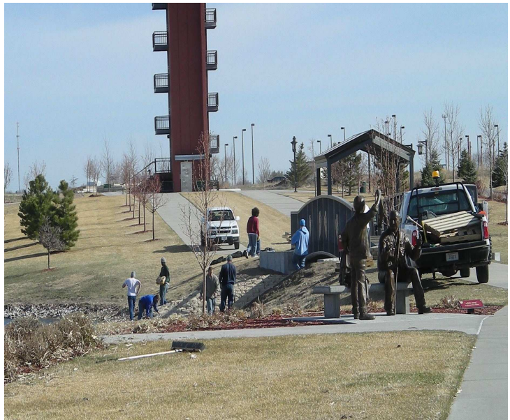
Youth volunteering at Yanney Park