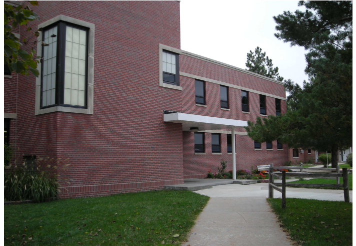
Morton Living Unit

Youth Level of Service/Case Management Inventory (YLS/CMI) is completed for all YRTC-K youth as part of Classification procedure to assess their risks and needs.