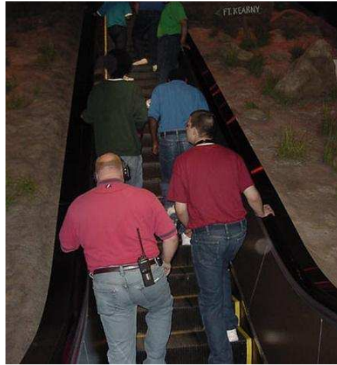
Youth at the Kearney Archway Monument for experiential learning.

YRTC-Kearney's accreditation as a Juvenile Correctional Facility by American Correctional Association (ACA) standards was awarded by the Commission on Accreditation in Kansas City in August 2007.