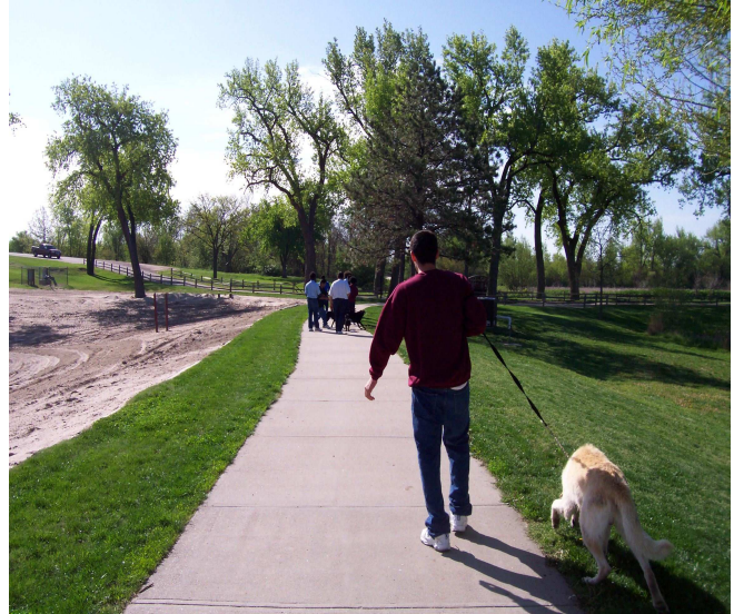
Youth exercising dogs for the Humane Society

YRTC-K's contracted psychiatrist provides services for youth identified with mental health conditions that require assessment for treatment, intervention, and/or stabilization. The psychiatrist will complete an individual medical psychiatric consultation/evaluation for each identified youth. A total of 99 youth received these psychiatric services.