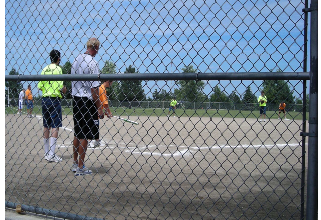
YRTC-K Annual All-Star Softgame Game

YRTC-Kearney has a wide variety of recreational equipment and areas that the youth have ready access to. This includes concrete play pads for each living unit. During the year, the youth participate in intramural sports seasons. These seasons include softball, football, volleyball, basketball, soccer and beach volleyball. The youth can swim in the YRTC-Kearney pool, both during Education classes.