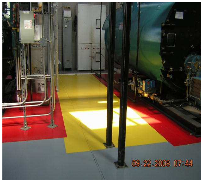
YRTC-K Boiler House