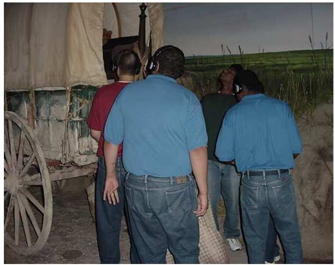
Youth learning about Nebraska history at the Kearney Archway Monument.

There were 400 individual student vocational interviews and Ansel-Casey assessments completed by the students. Forty six students were administered the ASVAB (Armed Services Vocational Aptitude Battery).