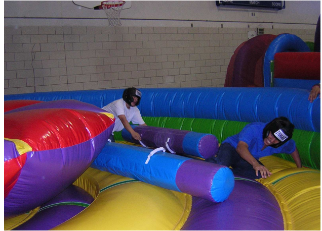
Youth enjoying the recreational equipment provided by CORN.

Two Bible studies are available to the youth each week. Adult volunteers lead the evening Bible Studies. The total number of youth attending Bible study was 628. This is an average of 11 youth attending each week.