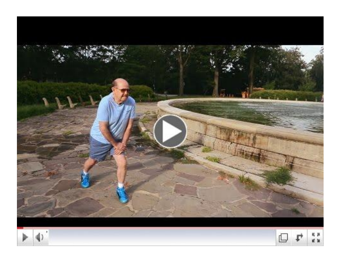
Heart Disease and Diabetes