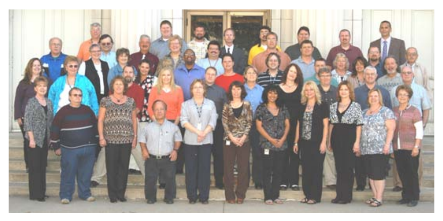
Pictured are IS&T employees in DHHS Service Areas, 24-hour facilities, Central Office & State Office Buildings.