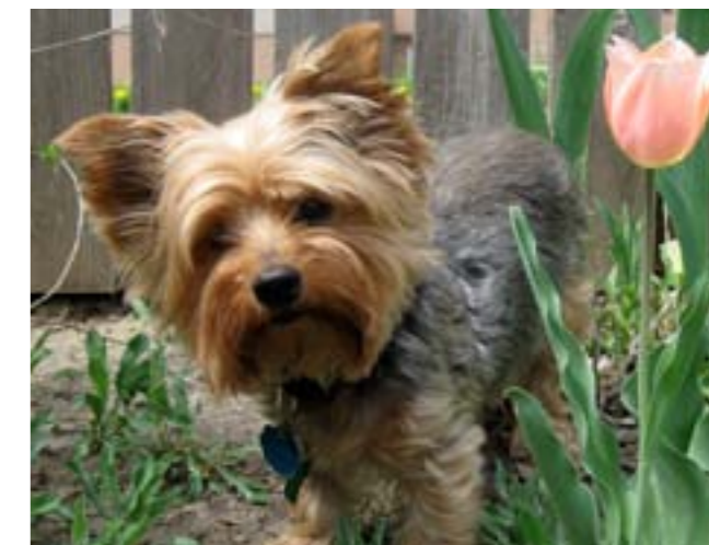
Pat Infield's dog Dutchey

Here's a link to a SharePoint slide show that showcases ALL of the great pictures we received for Bring Your Pet to Work Day.