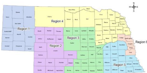
Behavioral Health Regions

For a comprehensive introduction to Nebraska’s System of Care, access the training video offered by the Behavioral Health Education Center of Nebraska (BHECN) at: https://www.unmc.edu/bhecn/education/nebraska-system-of-care/training.html