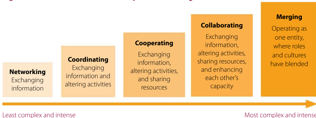
Figure 2. Continuum of a Community-Clinical Linkage

Adapted from Himmelman AT. Collaboration for a Change: Definitions, Decision-Making Models, Roles, and Collaboration Process Guide .