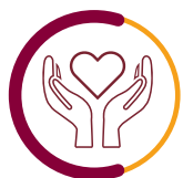
Figure 1. Public Health Sector Linking Community and Clinical Sectors

In addition, community-clinical frameworks and tools have been developed to prevent and control type 2 diabetes and obesity and to measure community-clinical relationships. Despite increased focus on community-clinical linkages in the literature, particularly in relation to community health workers, there is little information about how to implement this approach. This guide serves to fill that gap and presents strategies that involve practitioners from the public health sector who are leading efforts to link community and clinical sectors (see Figure 1).