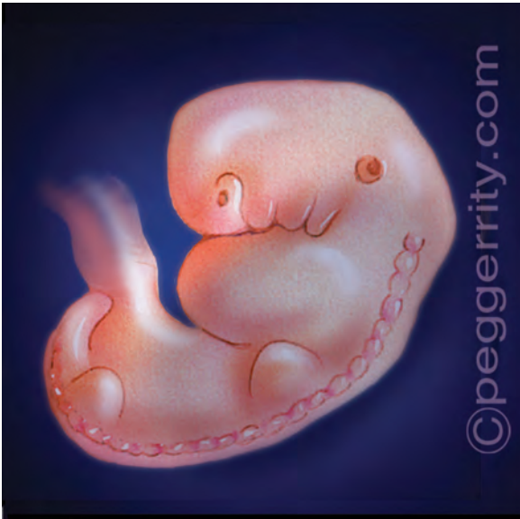
Size: Less than one fifth of an inch.