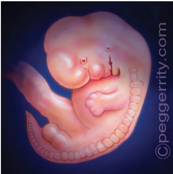
Size: About one third of an inch.