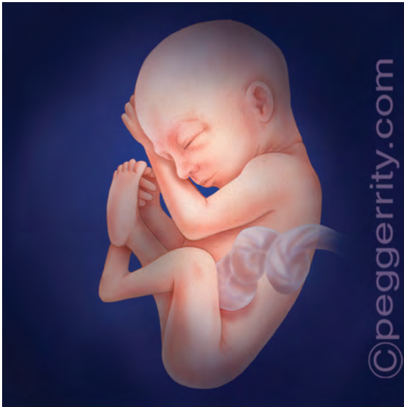
Length 8\frac{1}{4} to 9 inches.