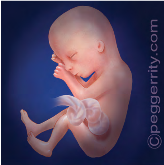
Length: 5\frac{1}{2} to 6\frac{1}{4} inches.