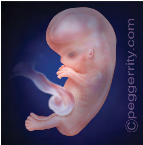
Size: One half to one inch.

Note: After 8 weeks of development, the embryo is called a fetus.